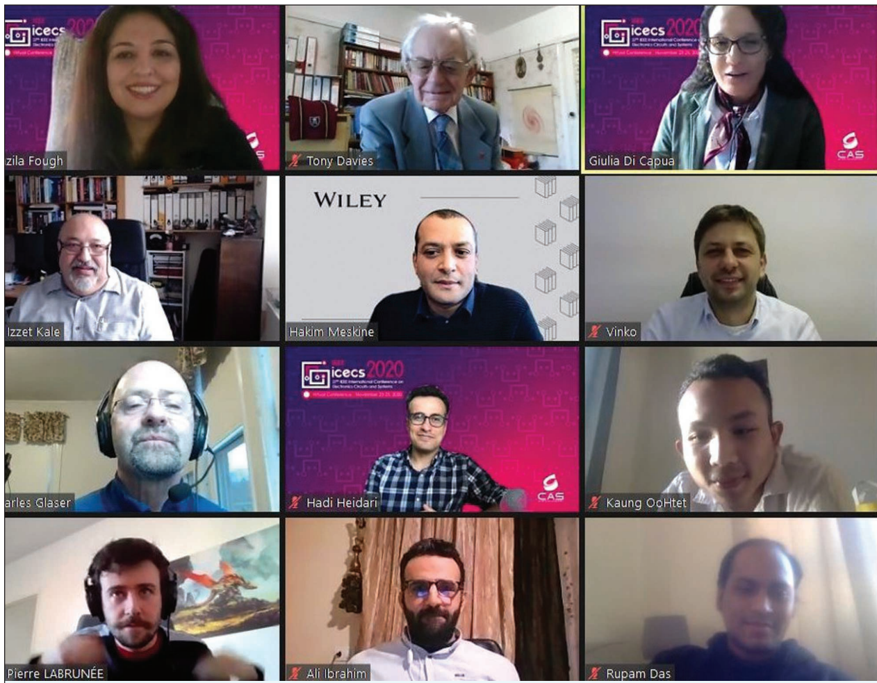
Figure 2. Some attendees of the YP session.