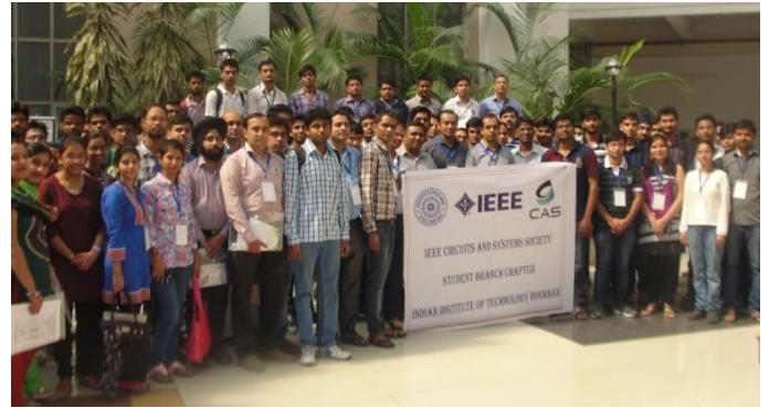
4. Participants and Organizers