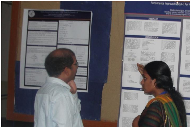
5. Poster Session