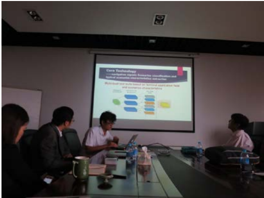
Fig. 7: Oral presentation.