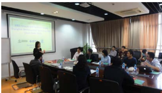
Fig. 1: Opening ceremony.