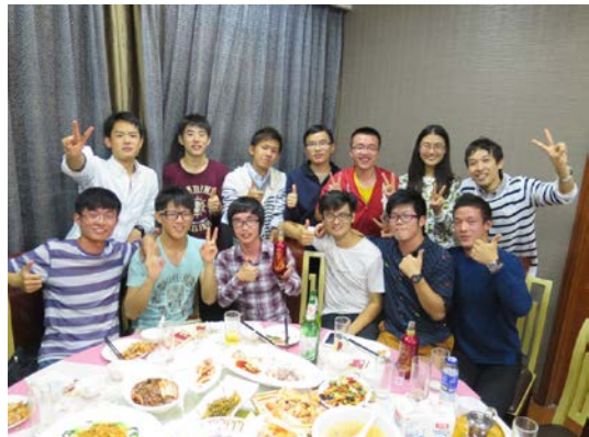
Fig. 10: During the banquet.