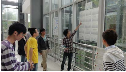
Fig. 5: Poster session.