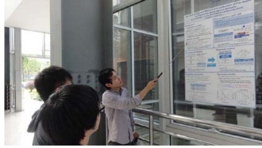
Fig. 6: Poster session.