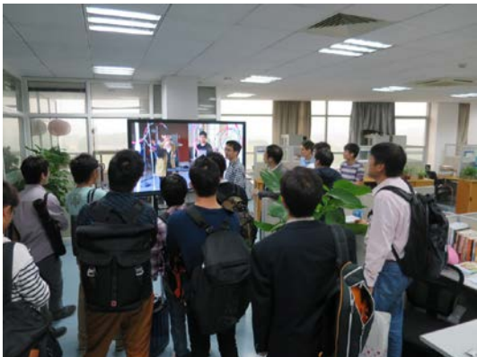
Fig. 9: Lab tour.