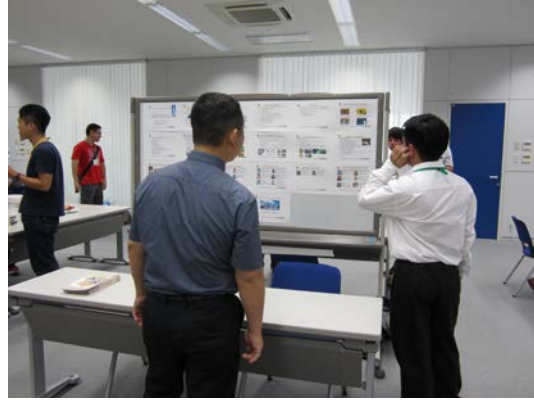
Fig. 6: Research matching forum.