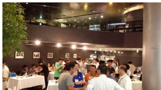
Fig. 2: WiCAS-YP reception.