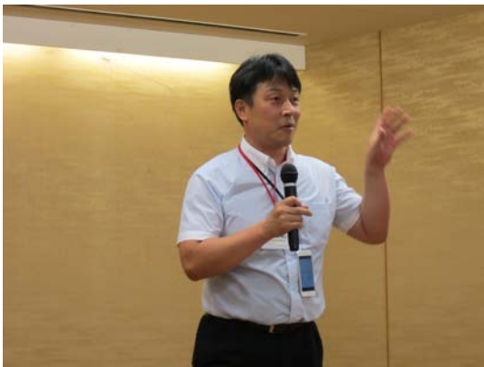
Fig. 7: Banquet speech by Prof. Ueta.