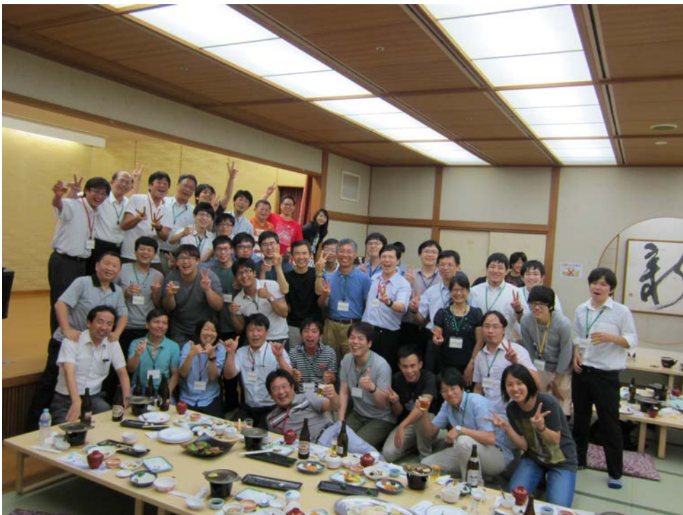
Fig. 9: Banquet.