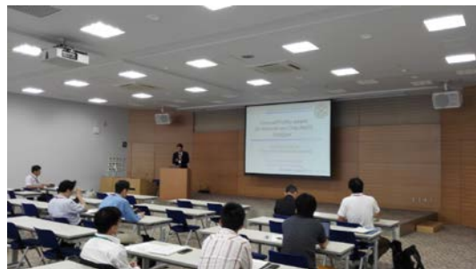
Fig. 4: Plenary talk by Prof. Sekiya.