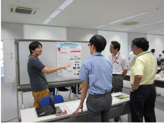
Fig. 5: Research matching forum.